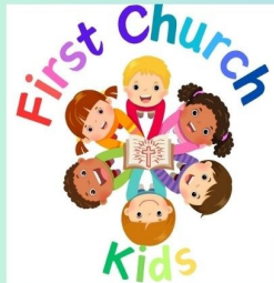
First Church - Children's Ministry