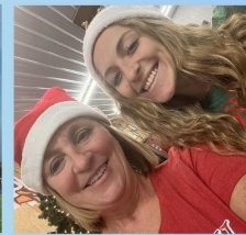
First Church Youth