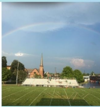
First United Methodist Church Outreach