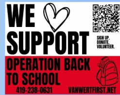
Operation Back to School