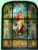
Van Wert First United Methodist Church